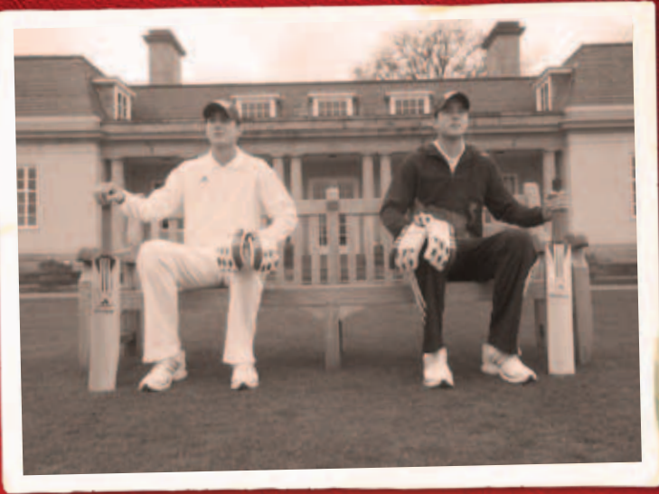
Double trouble: The Broadys prepare for some Red Bull Catch 2:2 action